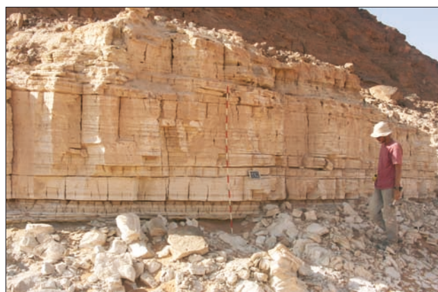
Fig. 3 Remnants of the early Holocene deposits typically consist of thinly laminated diatomites and mollusc-bearing carbonates providing a high-resolution environmental archive.