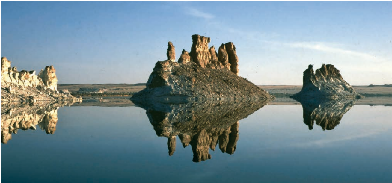
Fig. 1 Lake Teli. The highly saline central lake of Ounianga Serir. The largest of its three islands has been used as a refuge during the more recent past, as suggested by archaeological remains at its top.