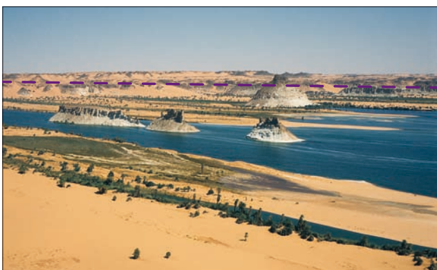
Fig. 4 Lake Teli. The dashed line at about 100 m above the lake marks the approx. maximum lake level during the early Holocene humid phase.