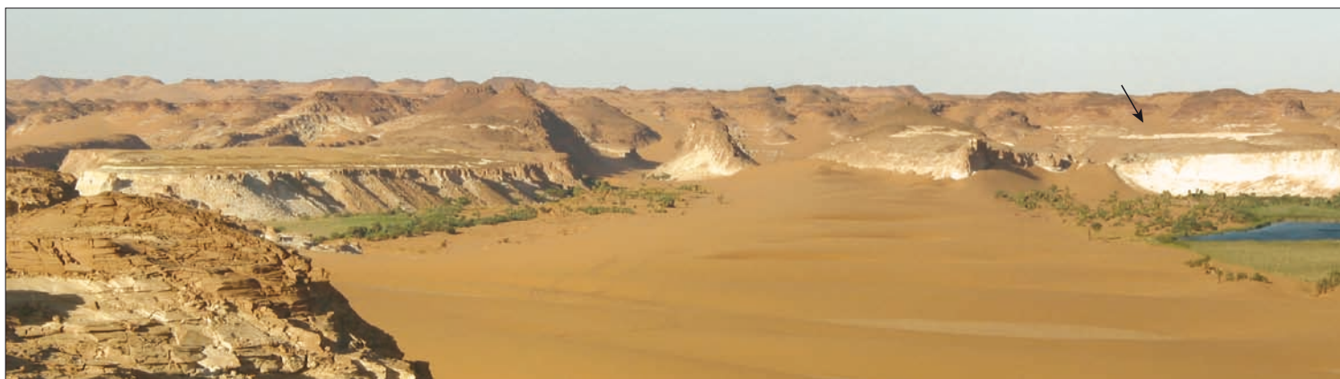
Fig. 6 Panorama of Lake Boku. Two thirds of the surface of the 13 m deep freshwater lake are covered by a metre-thick floating reed mat. Fish and gastropods presumably descend from their 9,000 year old ancestors in the deposits exposed 80 m above (arrow). Encroaching dunes have already filled up the adjoining lakes.

The relic freshwater lakes of Ounianga Serir have conserved the genetic heritage of the Sahara's humid past over more than 3,000 years of hyperaridity (Fig. 6). Because their ecology has remained widely intact, various aquatic plants and organisms including several species of fish and gastropods have survived to the present day. ACACIA's field studies at Ounianga have only broken the ground for more detailed geological, limnological, hydrological, biological, archaeological, and other research which can rely on the well-established collaboration with the Chadian Centre National d'Appui à la Recherche (CNAR).